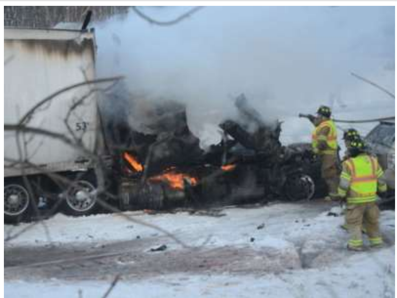
Pileup on I-94 between Battle Creek and Galesburg on January 9 th , 2015.

The goal of the workgroup is to create a support attachment to the County Emergency Operations Plan and develop an EOC tabletop exercise for the entire event and a command post exercise designed for the first 3 hours of the event.